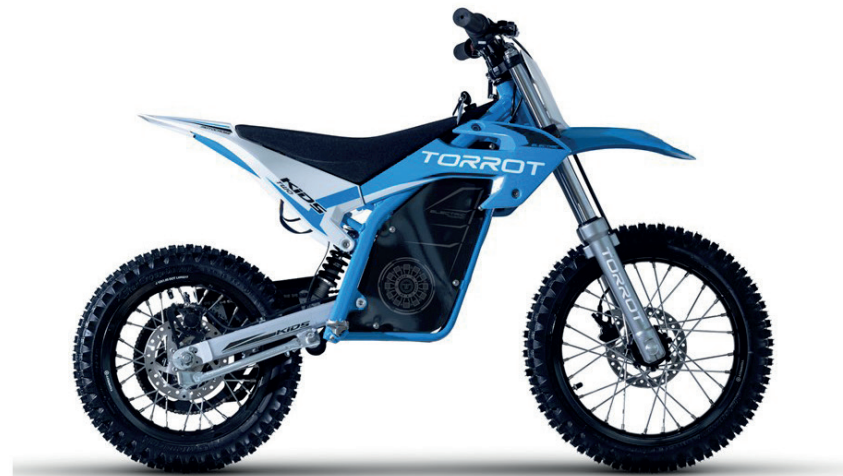
MOTOCROSS TWO 6-11 Jahre / ans