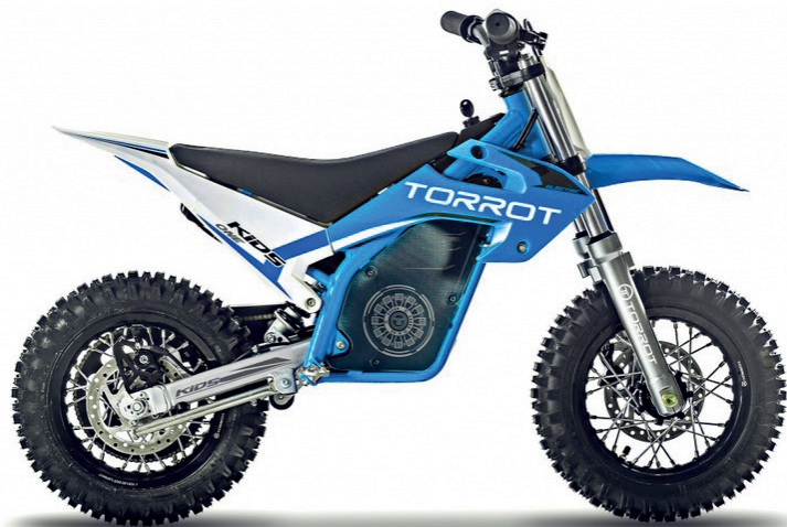
MOTOCROSS ONE 3-7 Jahre / ans

find your dealership: www.torrot-kids.ch