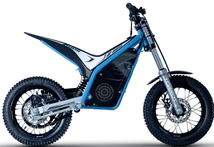
TRIAL ONE & TWO 3-7 Jahre / ans

find your dealership: www.torrot-kids.ch