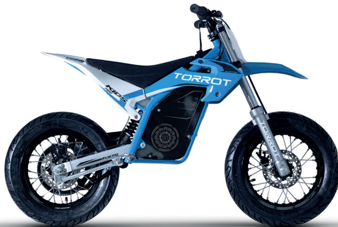
SUPERMOTARD ONE 3-7 Jahre / ans

find your dealership: www.torrot-kids.ch