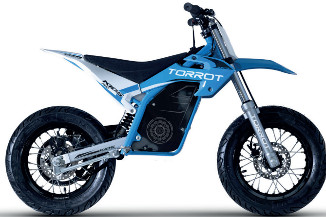
SUPERMOTARD TWO 6-11 Jahre / ans